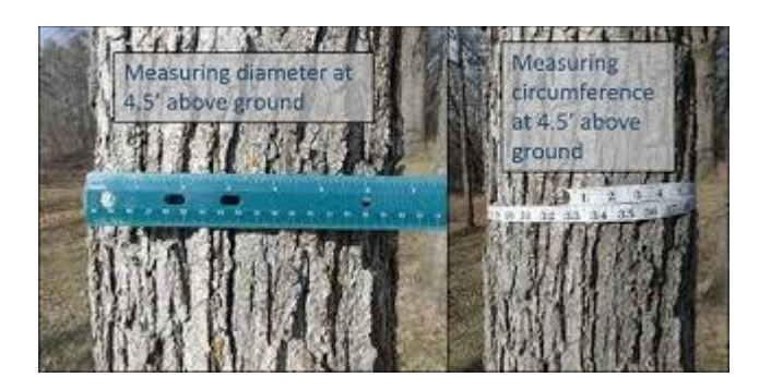
*Diagram showing how to find diameter at breast height (DBH).