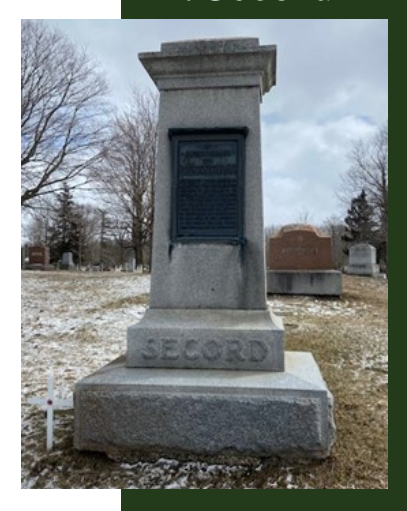
Monument 1 currently located in the Kincardine Cemetery.